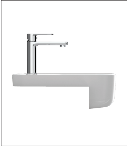
Tapware shown not included.

The Sculptural basin range represents freshness and simplicity of nordic style design. Influenced by global trends in thinner rim design, the wide variety of shapes and sizes is sure to appeal to the style conscious seeking luxury design. The basin is suitable for general purpose, domestic and commercial applications.